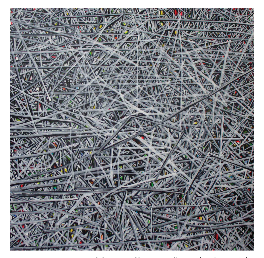
Untangled Segments White, 2011 Acrylic on wood panel 60 x 60 inches

The Broad Institute's artist-in-residence program stimulates collaborative problem solving with an interdisciplinary approach. Together, artists and Broad scientists explore issues of visual representation, and the communication of ideas toward a greater understanding of the complexities of the genomic landscape.